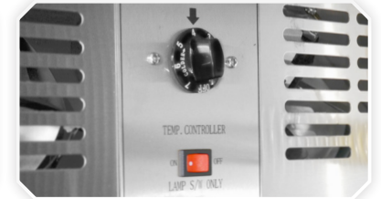
Mechanical temperature controller