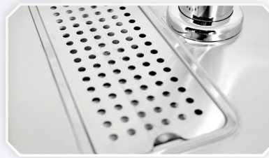
Stainless steel top tray cover