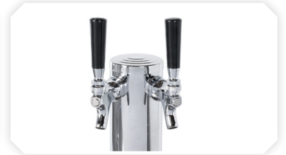
Optional order (Item 44224): Double tap tower