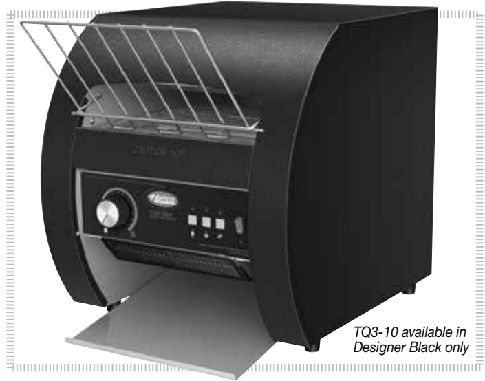
TQ3-10 available in Designer Black only