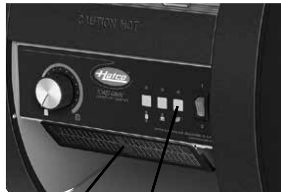
Air Intake Filter Screen