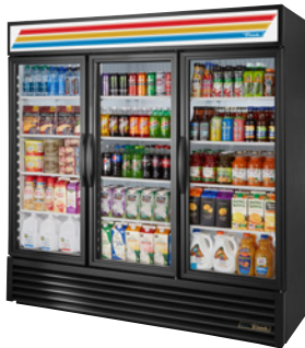
Standard Black Exterior