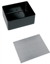
DRIP TRAY KIT (2.5"HT-HW2) Product #: 02497.0000