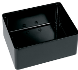
DRIP TRAY Product #: 02545.0000