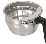
FUNNEL ASSY, SST-BLK HDL(7.12)