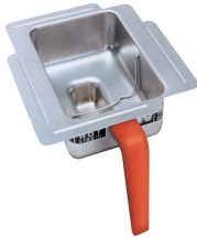
FUNNEL ASSY,SST-PP ORANGE HDL