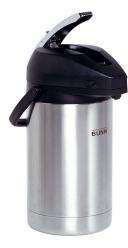
AIRPOT, 3.0L SST LA 6/ CASE