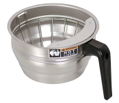
FUNNEL ASSY, SST-BLK HDL(7.12)